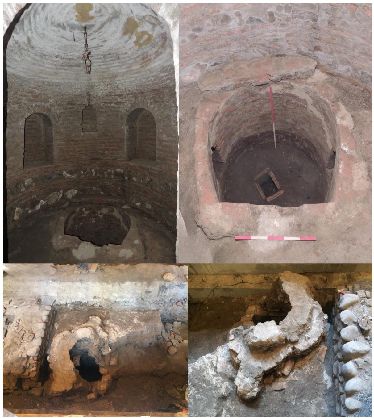
Figure 2 - Beglar Akhospireli Street № 1/6- Cellar with the refrigerating well inside and Gudiashvili Square 7/2- ceramic workshop and kiln