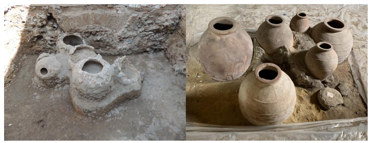
Figure 3- Abo Tbileli Street №6- Wine cellar and Beglar Akhospireli Street №4- Wine cellar