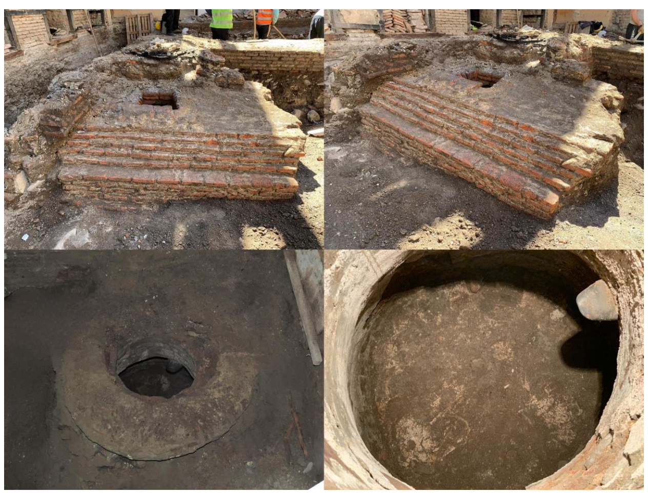
Figure 4 - Abo Tbileli Street №6- Reservoir and Abo Tbileli Street №6- Water reservoir